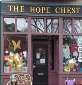
397 Market Street, Lowell

which is held in Connecticut. I have a realistic plan and goal to buy a car in a month with my tax return. House of Hope was a stepping stone for me to get to where I am today."