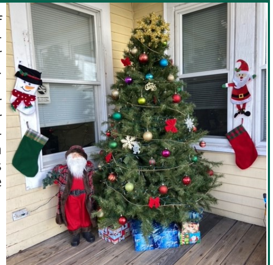
Christmas Tree on our shelter porch